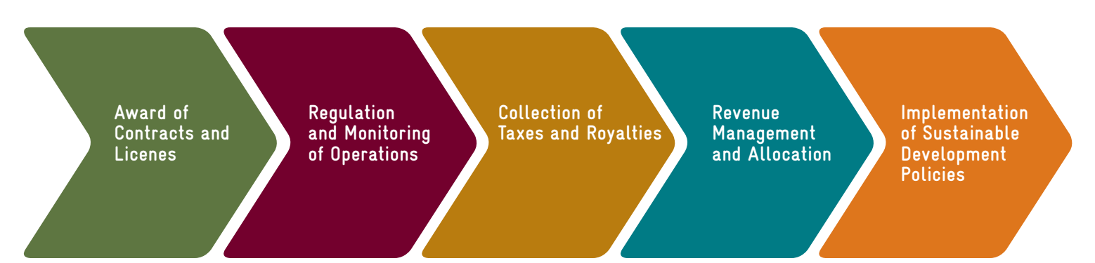
Figure 1: The extractive industries value chain

One increasingly prominent way of systematizing the numerous governance problems associated with resource extraction is found in the extractive industries value chain (Natural Resource Charter 2010; World Bank 2009). Governance problems exist all along this chain, they begin when the decision to extract is (to be) taken and continue all through the phases of exploration, construction and production until after the closure of any operation.