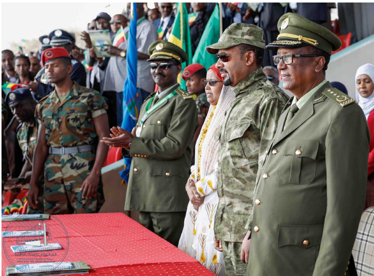
Abiy Ahmed with military commanders, 14 February 2019 (Photo: Office of the Prime Minister, Ethiopia, on Flickr, Public Domain).

For more than a year, the civil war between the Ethiopian government and the Tigray People's Liberation Front (TPLF) has been causing severe human suffering and fatalities in the thousands. According to the Office of the United Nations High Commissioner for Human Rights, both conflict parties have committed serious human rights violations. 1 This Spotlight shows how the shifting dynamics of ethnic power relations and the strategy of elite management pursued by Prime Minister Abiy Ahmed contributed to the escalation of violence.