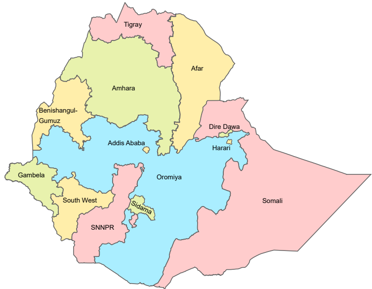
Map 1: Regional states of Ethiopia.

the creation of the Prosperity Party in December 2019. Following TPLF refusal to join the new coalition party, in early 2020 Abiy began replacing TPLF government ministers with independent Tigrayans such as Lia Tadesse and Abraham Belay, a former TPLF member turned critic. The appointment of Lia